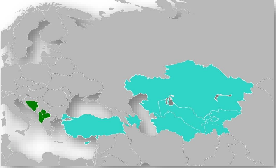
Map 2 ABIF and OABIF States